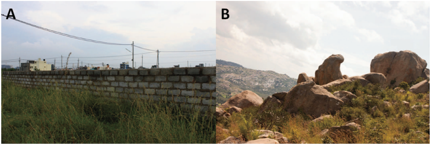
FIG. 1. Example of sampling sites in (A) urban and (B) rural habitats in and around Bangalore, India.